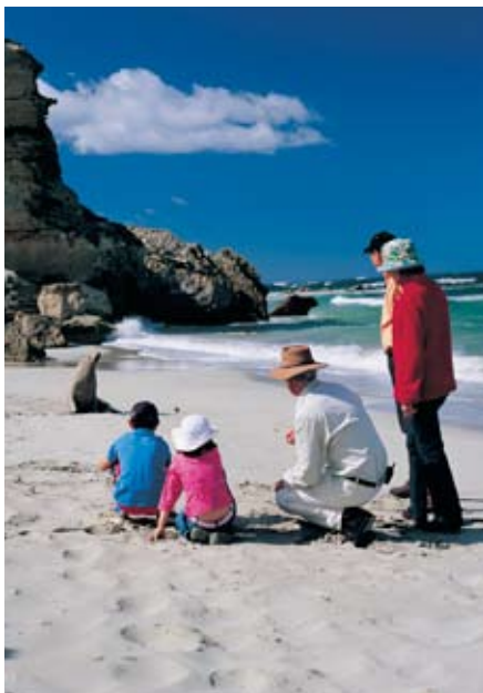
Guided tour, Seal Bay Conservation Park